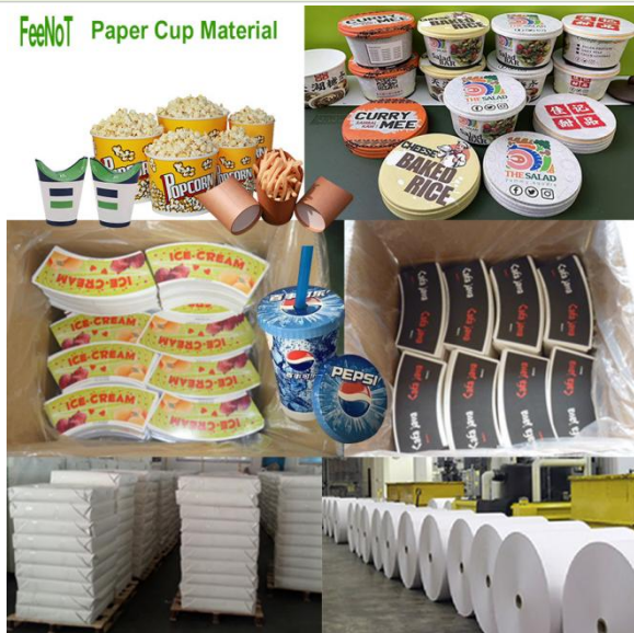
FeeNoT Paper Cup Material

1-1, buy PE coated paper roll (narrow), Price: $1000/Ton, Min order: 1Ton, (paper cup bottom roll paper, width and thickness against the cup size, information is on cup drawing, or user choose the paper )